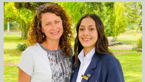
WE'RE LAUNCHING A NEW ADRA AMBASSADOR PROGRAMME IN SCHOOLS! P7