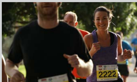
TAKE ON A CHALLENGE AS A TEAM! JOIN THE ADRA HOME RUNS TEAM CHALLENGE THIS JULY. P7