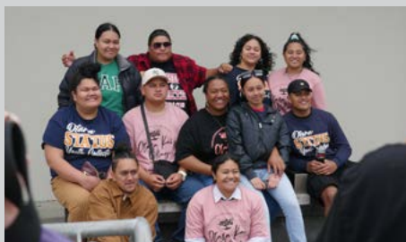
THE ŌTARA KAI VILLAGE IS AN AWESOME EXAMPLE OF WHAT PARTNERSHIP LOOKS LIKE AT A LOCAL COMMUNITY LEVEL. P4-5