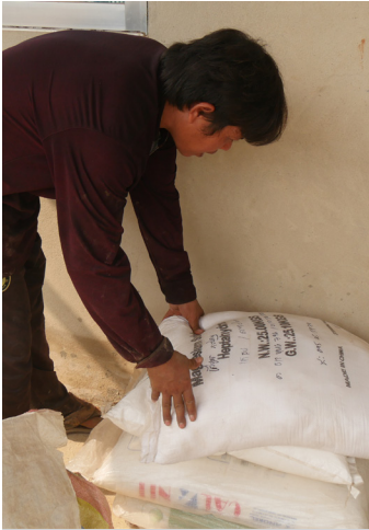
WITH THE HELP OF ADRA, THE FAMILY'S INCOME HAS INCREASED WITH BETTER CROPS AND EDUCATION.