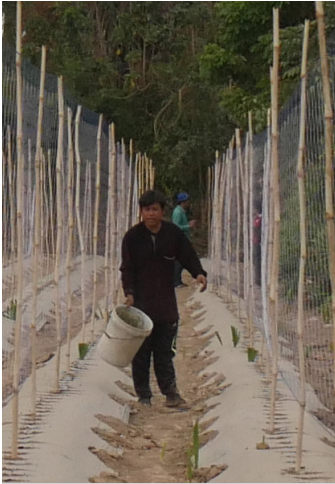
RA'S FATHER WORKING ON HIS CROPS IN RURAL CAMBODIA.