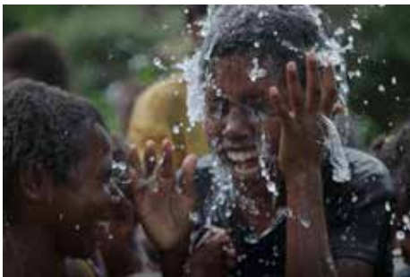
The village OF ELIA IN VANUATU NOW HAVE ACCESS TO A CLEAN WATER SOURCE NEAR THEIR VILLAGE. P5