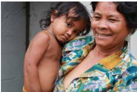
This Christmas KEEP JESUS' LEGACY OF JOY BY SHARING IT WITH THE WORLD AROUND YOU. P7