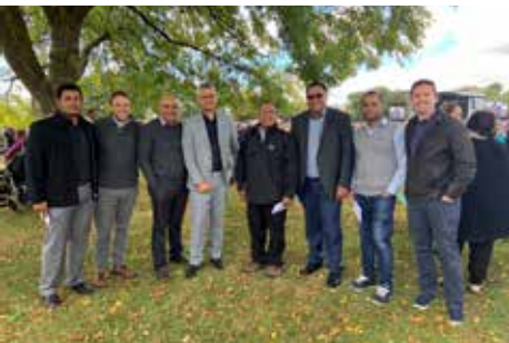
Community TRANSFORMATION PARTNERSHIP (CTP) IN SOUTH NEW ZEALAND BRINGS HOPE & HEALING. P4