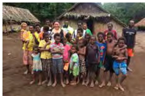
Justice FOR THE PEOPLE OF BUTMAS IN VANUATU AS THEY RECEIVE A LIFE-CHANGING GIFT OF HOPE FOR THEIR VILLAGE. P4