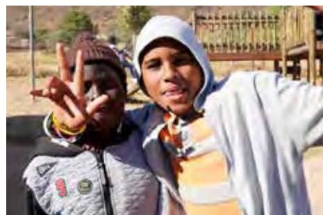
Love FOR ONE ANOTHER AT THE KHOMELELA COMMUNITY CENTRE PRESCHOOL, IN SOUTH AFRICA. P6