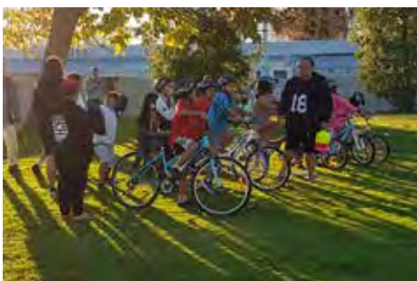
Compassion IN ACTION. THE ENDERLEY CREW SALVAGE PROJECT IN HAMILTON HELPS YOUNG PEOPLE RESTORE SALVAGED BIKES. P5