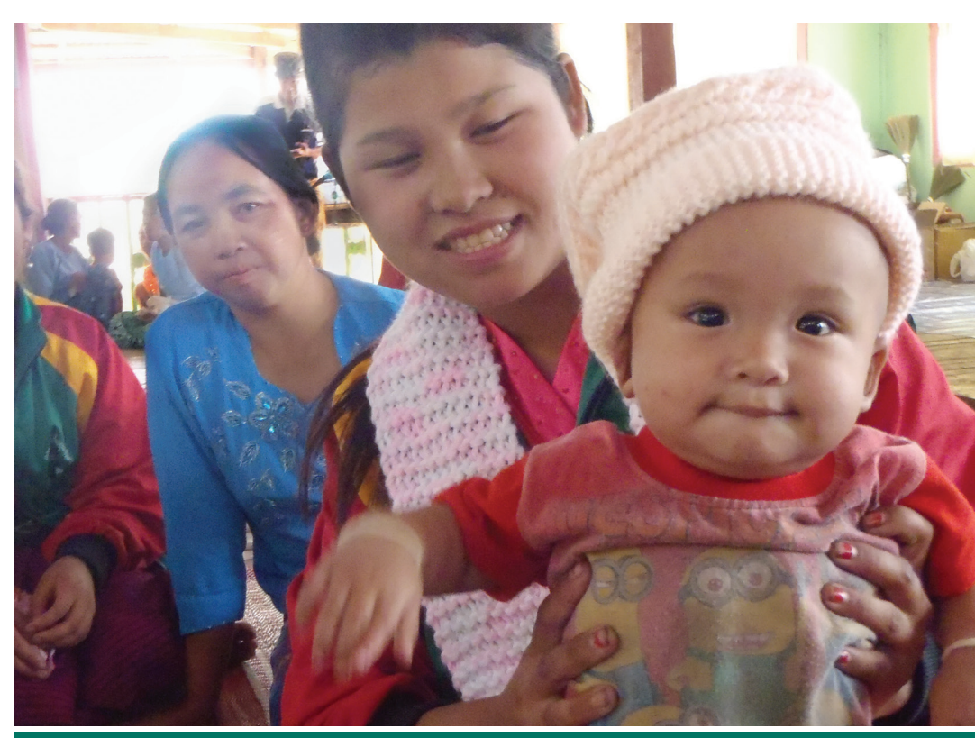
REAL is funded by ADRA New Zealand and the New Zealand Ministry of Foreign Affairs and Trade, and implemented by ADRA Myanmar

Now, Nan can see a way for her dreams to come true. It will take time and effort - she'll need to buy machinery to speed up production - but she has the belief and tenacity to make it happen. The REAL project works with 10 communities in rural Myanmar to increase livelihood opportunities through training and by providing small start-up capital investments. Additionally, 423 rain-collection tanks and 14 storage collection tanks, along with 420 latrines have been built to improve the health and hygiene of families in the region.